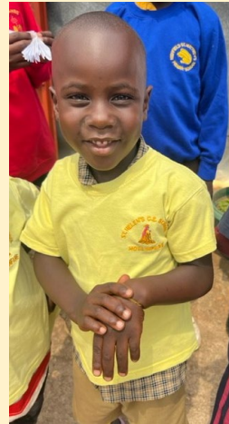
Misurch St Helen's