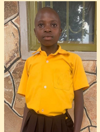
Shirat N Halewood